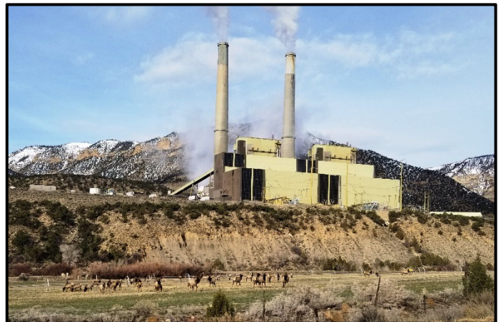
Huntington Power Plant

The SRMG contract became effective July 8, 2020 and represents the ninth (9 th ) fly ash agreement in SRMG’s portfolio of fly ash sources in Arizona, New Mexico and Utah.