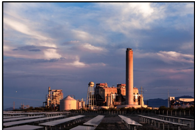
Apache Generating Station

Marketing Apache Class “F” Fly Ash will add to SRMG’s 46-year legacy of recycling fly ash from power plants. Over that timespan SRMG’s efforts have resulted in the successful recycling of more than 16 million tons of fly ash. Using fly ash for beneficial purposes in concrete and concrete products saves valuable landfill space which also eliminates potential environmental impacts.