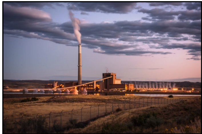
Bonanza Power Plant, Vernal, Utah

The SRMG contract becomes effective in March of 2017, and represents the sixth (6 th ) ash agreement in SRMG’s portfolio: Cholla, Four Corners, Escalante, San Juan, Coronado and now, Bonanza.